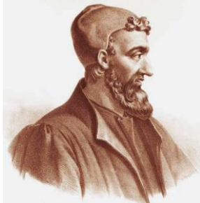
Galen of Pergamum, undated lithograph

Many ancient peoples thought that disease was a punishment imposed by the gods for bad behavior. The ideas of Galen of Pergamum , a Roman physician who lived around 200 AD, influenced Western medicine for nearly 2000 years. One of his theories was that disease was caused by miasma , a poisonous vapor which carried particles of rotting materials. This idea made sense to people who knew that eating spoiled food, drinking dirty water, or breathing polluted air could make you sick. People did not know that microorganisms existed, and they didn't realize that disease could be passed from a sick person to another, healthy individual.